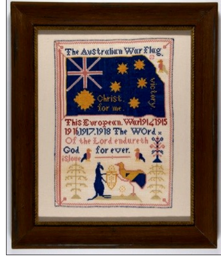
Australian Government Department of Veterans'Affairs