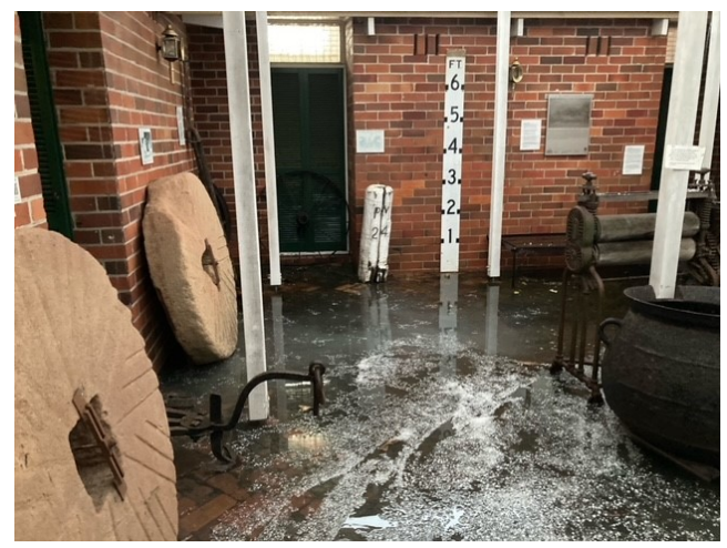
History Awash or Awash with History? The North Courtyard immediately after a recent hailstorm.